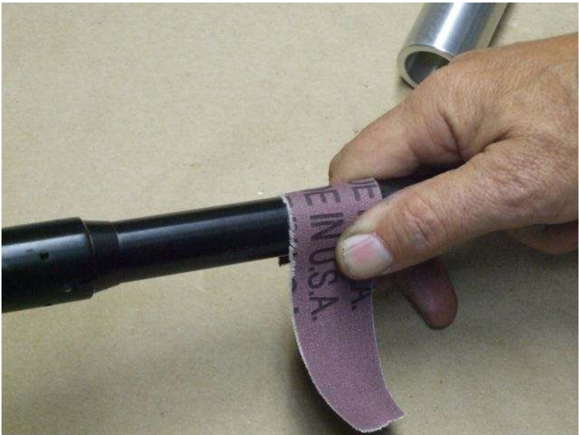
Sand the barrel where the epoxy will be applied and clean up with acetone