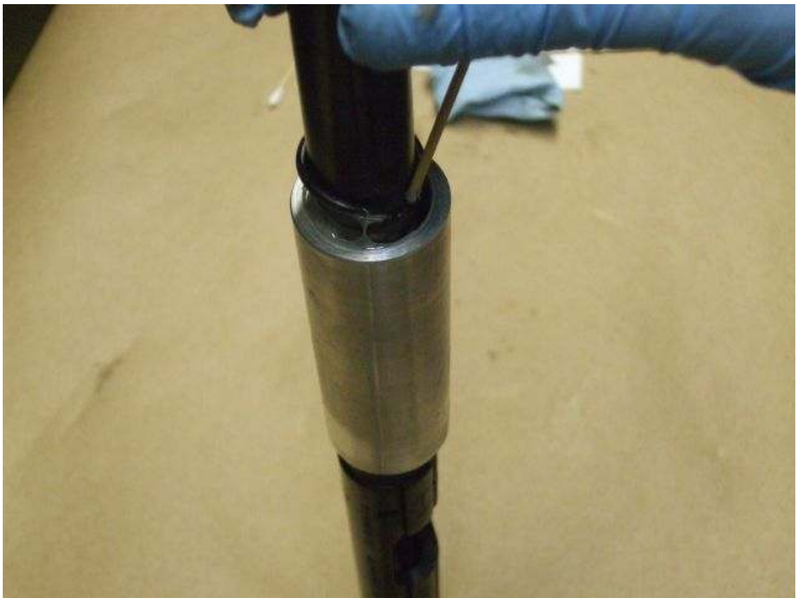
Insert the second O ring and clean up everything thoroughly with acetone