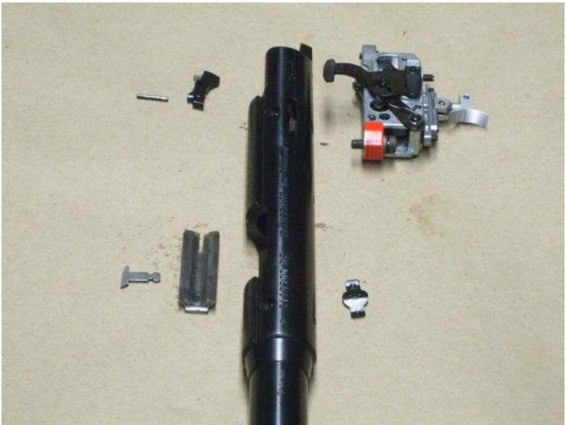
Remove the trigger, bolt stop, ejector and follower from the barreled action