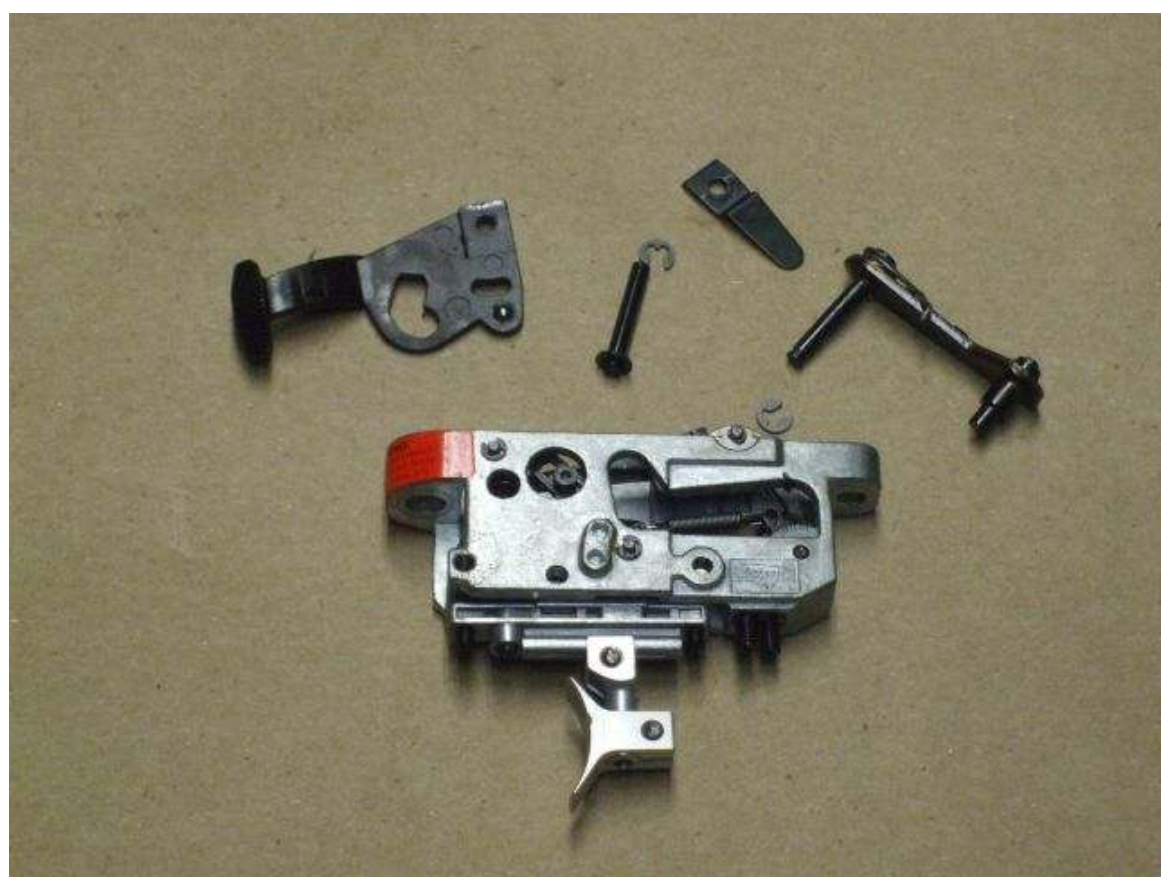
Remove the two E clips and the safety mechanism from the outside of the trigger