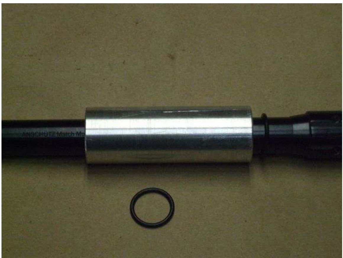
Choose the appropriate size O rings for your barrel diameter