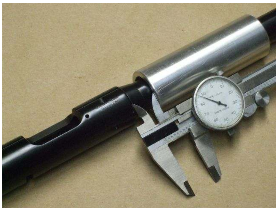
Carefully remove the barrled action and note the distance from the sleeve to the action