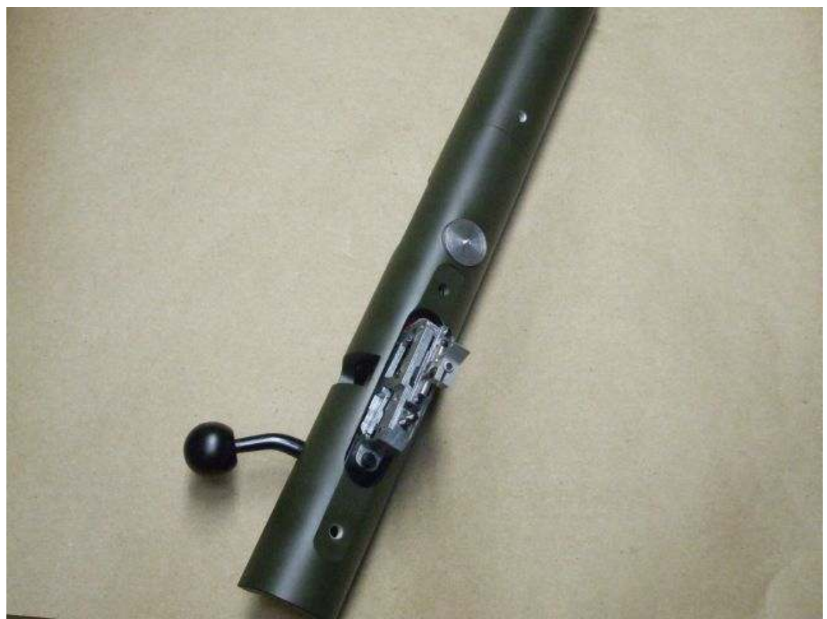
Test assemble your action into the stock and make sure everything lines up correctly