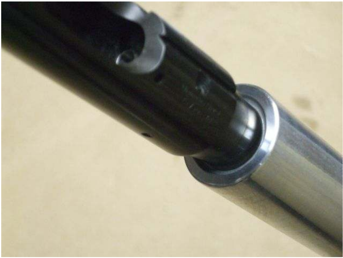
Adjust the location of the sleeve to the dimension previously noted during test assembly